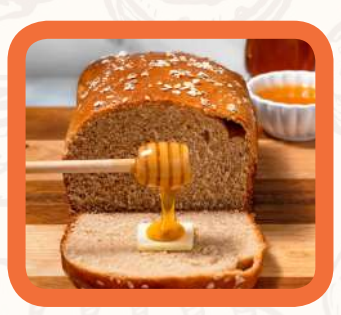
Honey Bread GH¢ 10.00 - GH¢ 15.00 Small - Extra Large