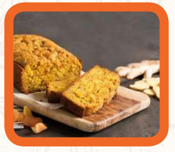
Ginger Bread GH¢ 10.00 - GH¢ 15.00 Small - Extra Large