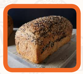
Seeded Bread GH¢ 10.00 - GH¢ 15.00 Small - Extra Large