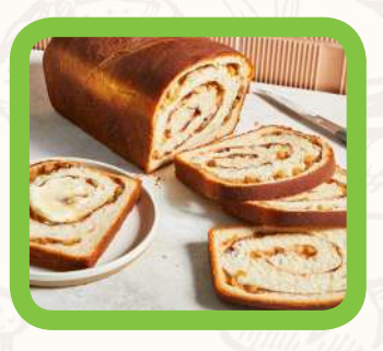
Cinnamon Bread GH¢ 10.00 - GH¢ 15.00 Small - Extra Large