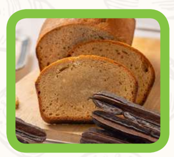
Prekesse Bread GH¢ 10.00 - GH¢ 15.00 Small - Extra Large