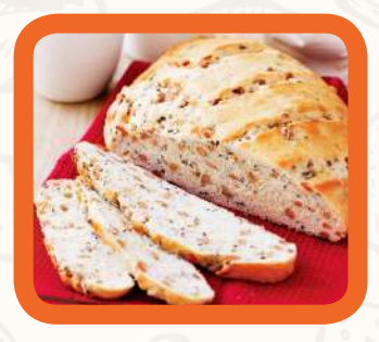
Soy Bread GH¢ 10.00 - GH¢ 15.00 Small - Extra Large