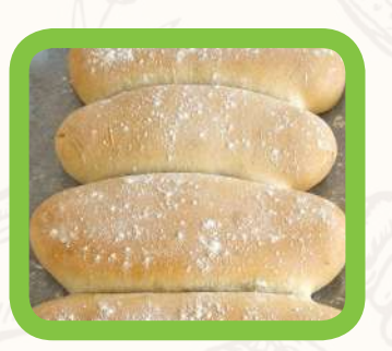
Tea Bread GH¢ 10.00 - GH¢ 15.00 Small - Extra Large