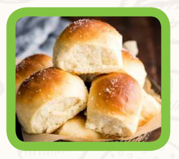
Rolls Bread GH¢ 10.00 - GH¢ 15.00 Small - Extra Large