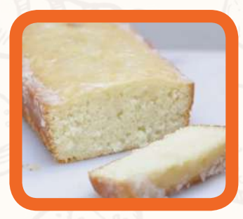
Coconut Bread GH¢ 10.00 - GH¢ 15.00 Small - Extra Large