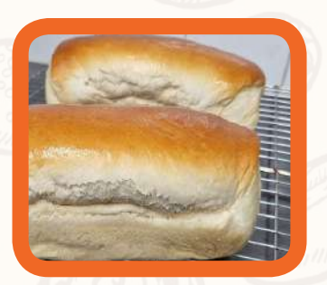
Sugar Bread GH¢ 10.00 - GH¢ 15.00 Small - Extra Large