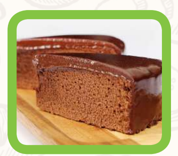
Cake Bread GH¢ 10.00 - GH¢ 15.00 Small - Extra Large