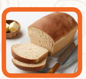
Whole Wheat bread GH¢ 10.00 - GH¢ 15.00 Small - Extra Large