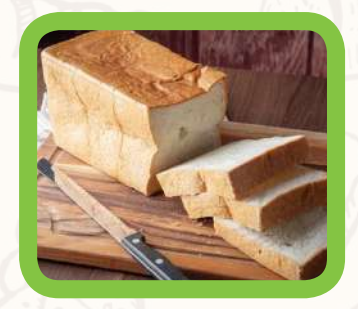
Butter Bread GH¢ 10.00 - GH¢ 15.00 Small - Extra Large

We have a wide variety of bread products at highly competitive prices. Based on our pricing strategy and objectives, we are able to deliver on our proposition of customer delight in terms offering competitive prices at the right weight and size without compromising on quality, taste, nutritional composition and shelve life. Under listed are the varieties of bread and prices of yummy bread bakery.