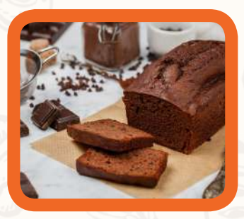
Chocolate Bread GH¢ 10.00 - GH¢ 15.00 Small - Extra Large