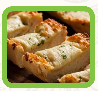
Garlic Bread GH¢ 10.00 - GH¢ 15.00 Small - Extra Large