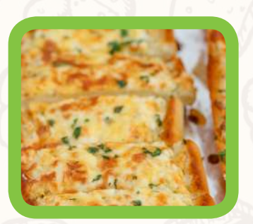
Fish Bread GH¢ 10.00 - GH¢ 15.00 Small - Extra Large