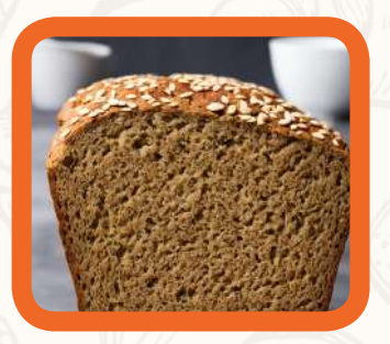
Agushi Bread GH¢ 10.00 - GH¢ 15.00 Small - Extra Large