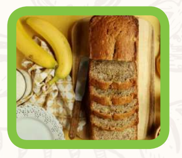
Banana Bread GH¢ 10.00 - GH¢ 15.00 Small - Extra Large